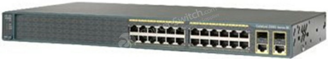
Table 1 shows the Quick Specs.

Figure 1 shows the appearance of the WS-C2960+24TC-S.