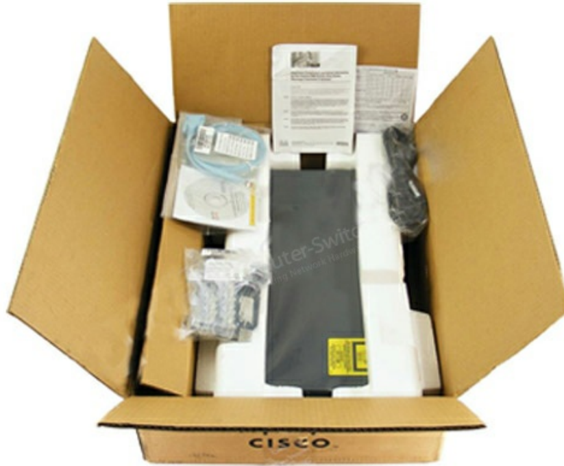
Figure 4 shows the unboxing view of WS-C2960+24TC-S.